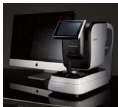
Image showing the Huvitz HRK-8000A connected to an external monitor(optional)