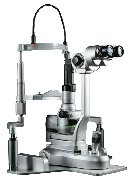
462mm h x 484mm w (front) 462mm h x 329mm w (side)

A complete line of custom Ultra M4 accessories are also available.