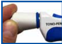
Roll the Ocu-Film + tip cover onto the tip.