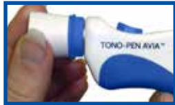
Position the Ocu-Film + applicator on the transducer.

Proper set up of the Ocu-Film® + tip cover is essential for the precision and accuracy of the tonometry measurement. A new Ocu-Film + tip cover must be used for each new patient. Be certain that the film is flat across the tip, but not too taut or too loose.