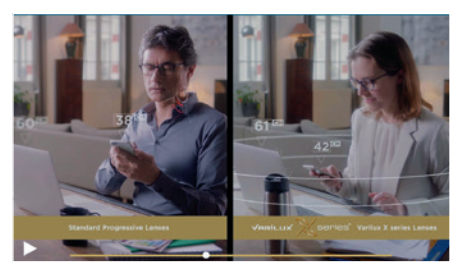
Show a simulation of personalized lenses