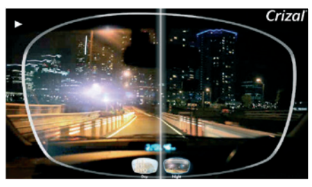
The benefits of premium lenses